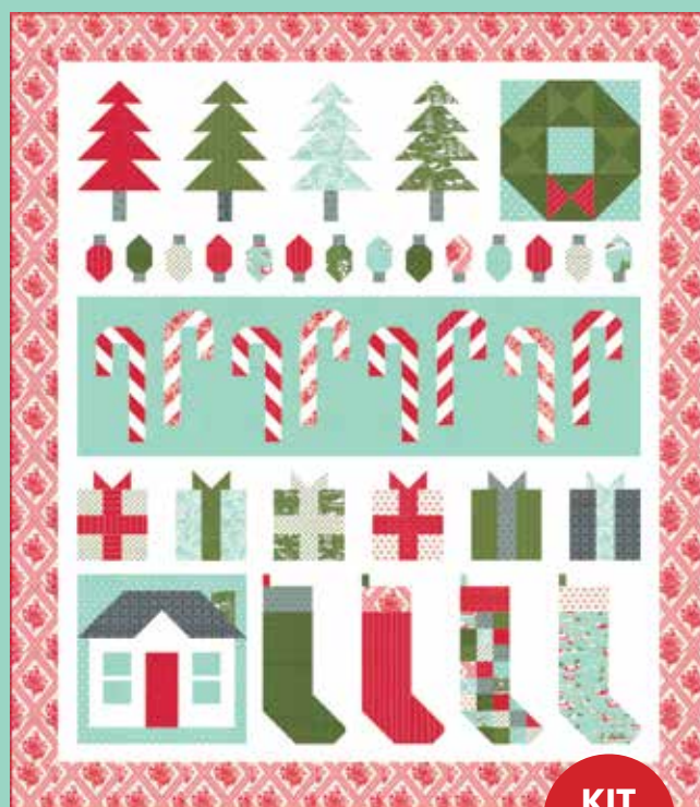
TB 255 Christmas Stroll 74" x 84" FQ Friendly