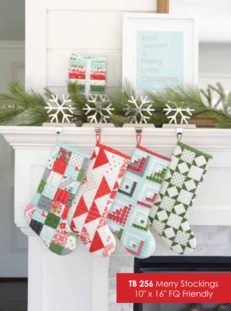
TB 256 Merry Stockings 10" x 16" FQ Friendly