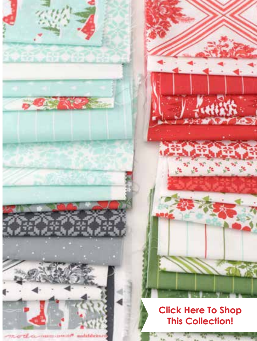
Click Here To Shop This Collection!