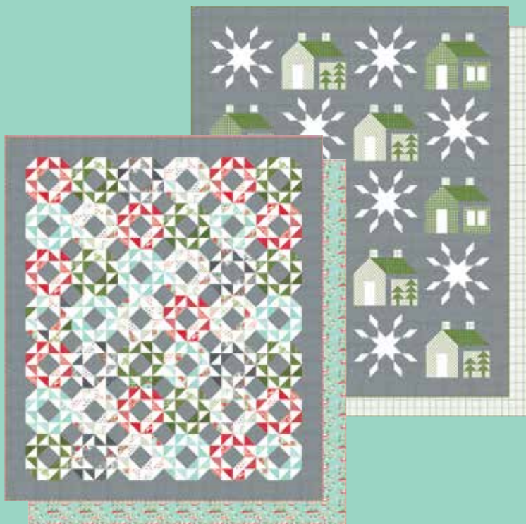
TB 258 Joyful 68" x 79" LC Friendly Backing - 55240 16